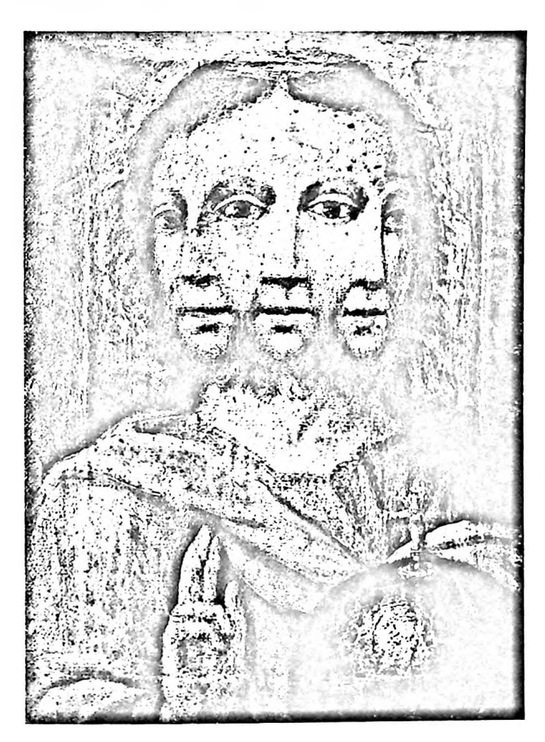
Medieval art sometimes depicted the Trinity as a single body with three faces.

"unworthy" of God—that is, something that is not worthy of the perfection of the supreme being of the philosophers—such words are not to be taken literally. Thus, for instance, if the Bible says that God walked in the garden, or that God spoke, one is to remember that an immutable being does not really walk or speak. Intellectually, this satisfied many minds. But emotionally it left much to be desired, for the life of the church was based on the faith that it was possible to have a direct relationship with a personal God, and the supreme being of the philosophers was in no way personal.